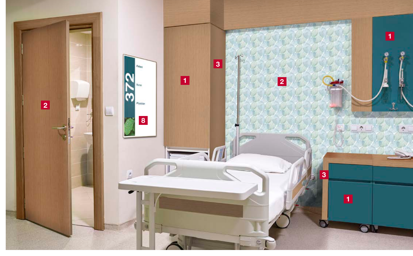
Patient Room | You can coordinate our HPL, TFL and FRL to create a calming, patient-oriented environment while assuring easy maintenance, functionality and long-lasting performance.