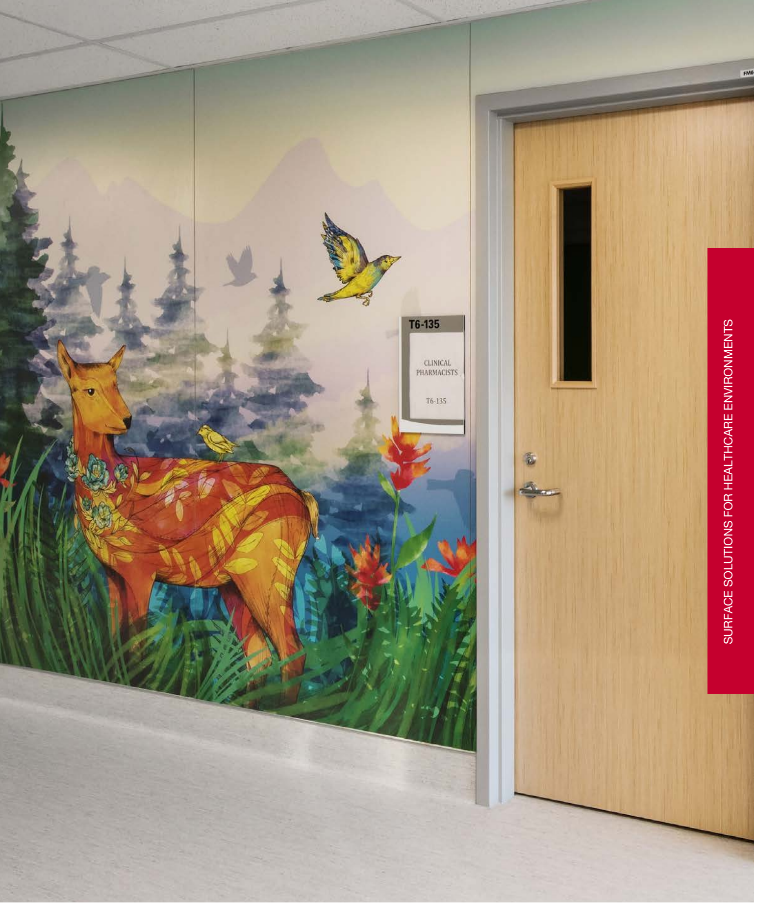
Hallway | FRL® wall panels provide high-impact protection 13 times higher than rigid vinyl and substantially lower smoke and flame spread than other competitive products. With a wide range of colors available, you can also expand your creative vision with our inhouse custom digital graphics. Ideal for wall murals, feature walls, headwalls, wayfinding and elevator cabs.